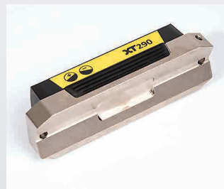
Precision ground prismatic base. Two holes for personal adaptations and brackets.