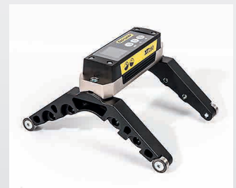
Legs for measurement on cylindrical surfaces with diameters larger than 55 mm. Accessory, Part No. 12-0901.

Easy-Laser® is manufactured by Easy-Laser AB, Alfagatan 6, SE-431 49 Mölndal, Sweden Tel +46 31 708 63 00, Fax +46 31 708 63 50, e-mail: info@easylaser.com, www.easylaser.com © 2020 Easy-Laser AB. We reserve the right to make changes without prior notification.